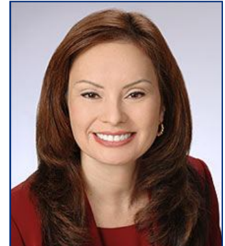
U.S. Treasurer Rosie Rios